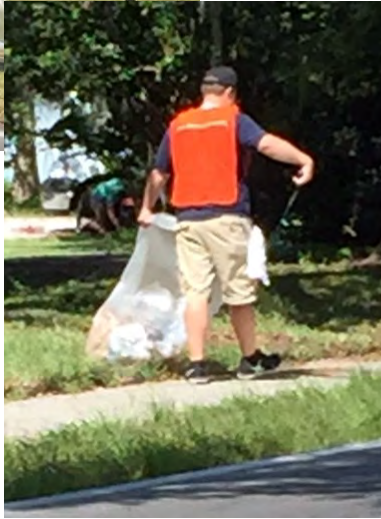
Adopt A Highway