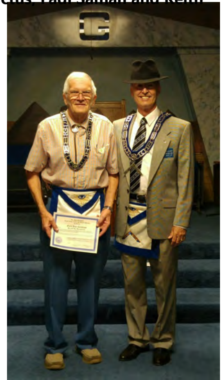
40 year Service Award for