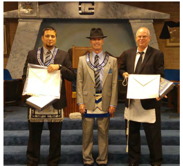
Apron and Bible Ceremony