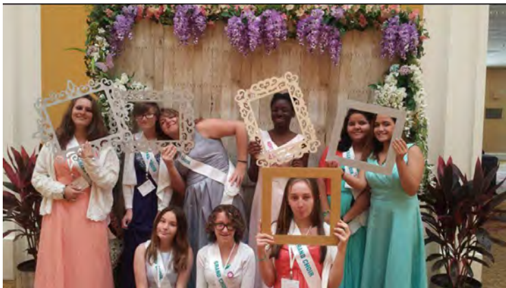
Fun at Grand Assembly