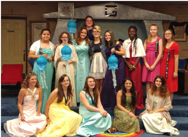
Rainbow Assembly Installation