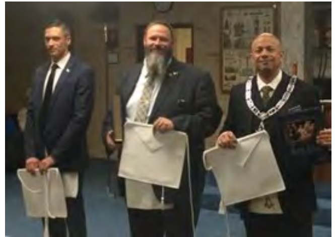
December Apron and Bible Ceremony