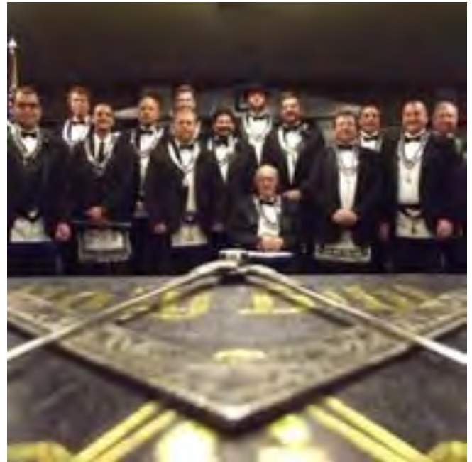
Our 2017 Officers and the Great Lights