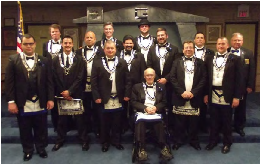
Our 2017 Officers striking a SERIOUS pose