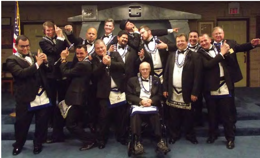
Our 2017 Officers getting a bit goofy