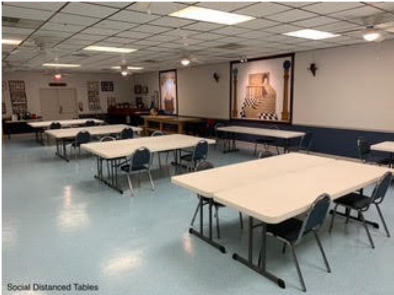
Pegram Hall—Ready for Social Distancing