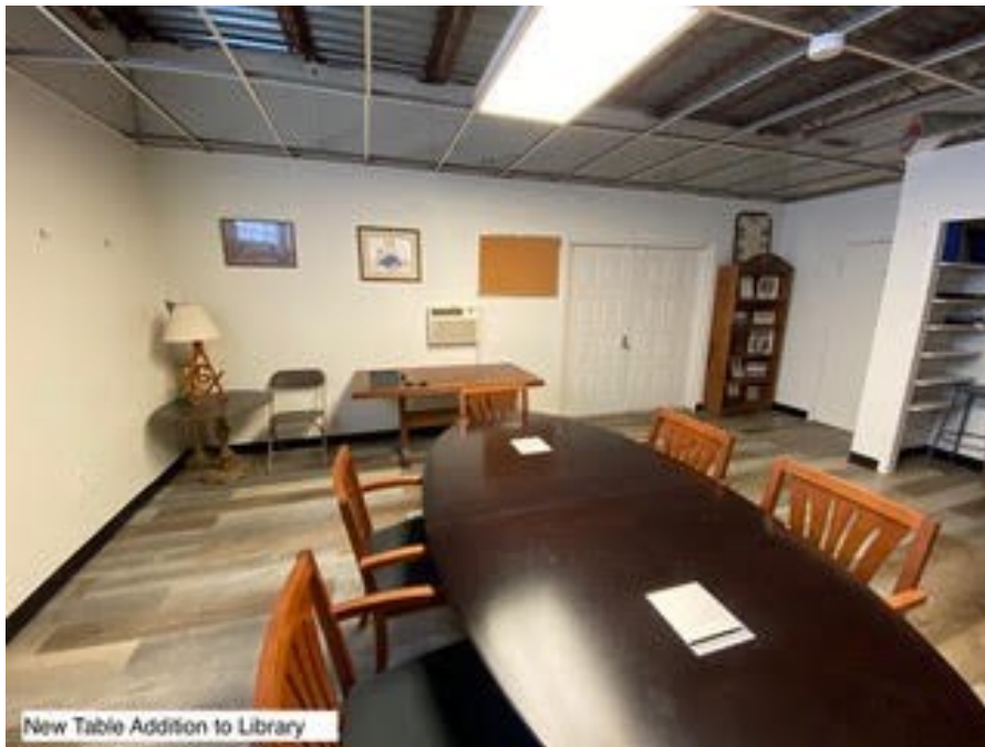
Library Refurbishment Completed!