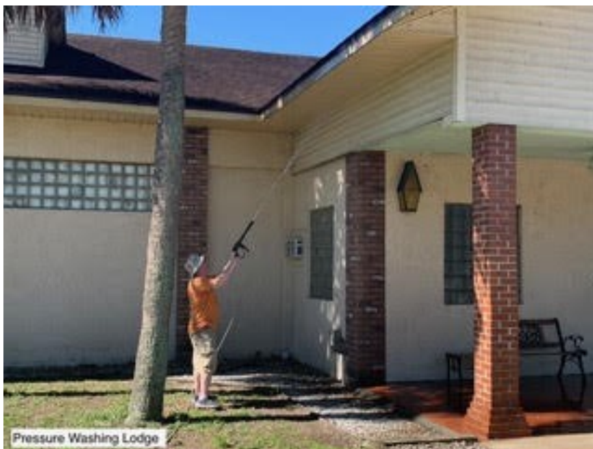
Bro. Dave Mataya pressure washing the exterior of the Lodge Building